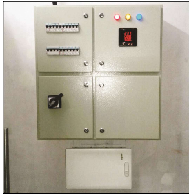
Electrical Panel in a Branch.

In Server room and ATM room, keep provision for additional sockets from alternate UPS DB so that in case there is some problem with one UPS the same can be switched over to another UPS by just shifting the connection from one socket to another.